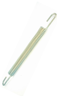
Draw Bar Spring

ZSB0101 Pin & Bush Assembly ZSB0071 Bush