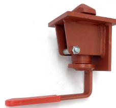
Screw Type Twistlock

ZA0801 Twistlock Assy ZA0802 Replacement Centre