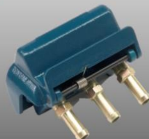
Trailer Half Triomatic O.E.M Z452/808/002/0 Alt. ZRL3521CF