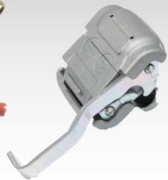
Truck Half Duomatic O.E.M Z452/802/000/0 Alt. ZRL3521CC