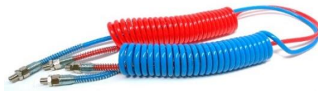
Duomatic Air Suzi