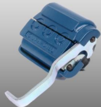
Truck Half Triomatic O.E.M Z452/806/000/0 Alt. ZRL3521CE