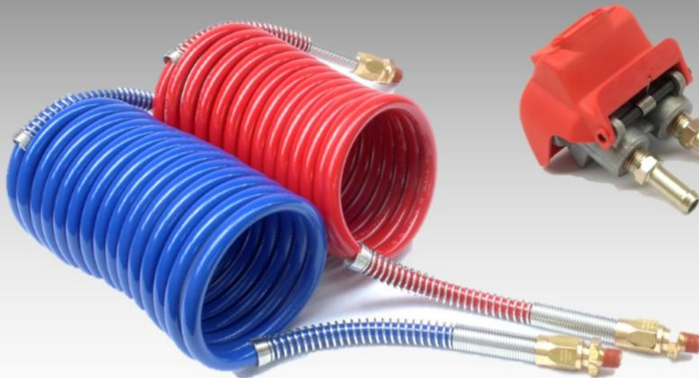
Trailer Half Duomatic O.E.M Z452/804/001/0 Alt. ZRL3521CD