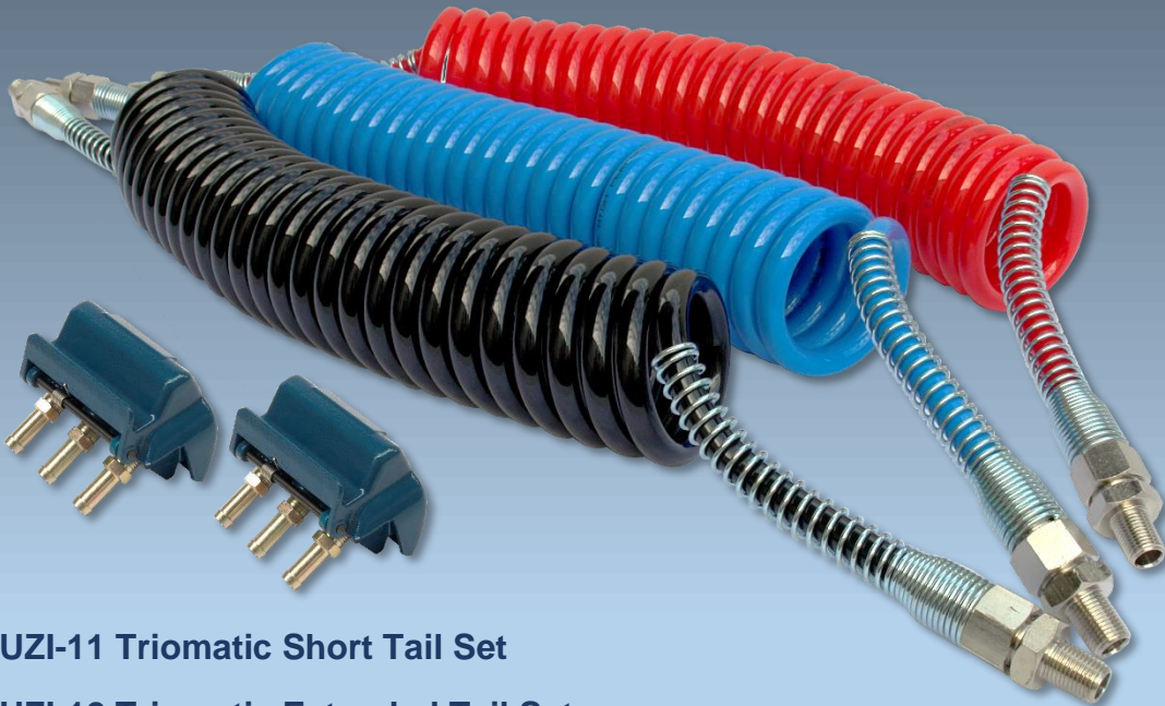
ZSUZI-11 Triomatic Short Tail Set