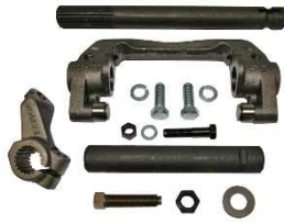
Roller Clutch Release Yoke Kit

Includes: Z105C137 Release Yoke Z22927 Release Shaft Z22921 Release Shaft