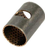
Clutch Housing Cross Shaft Bush