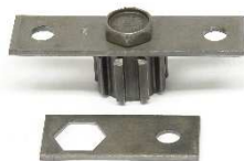
Manual Clutch Adjuster