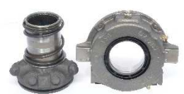
ADVANTAGE/SOLO Clutch Release Bearing Assembly