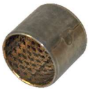
Clutch Housing Cross Shaft Bush