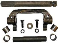
STD Clutch Release Yoke Kit