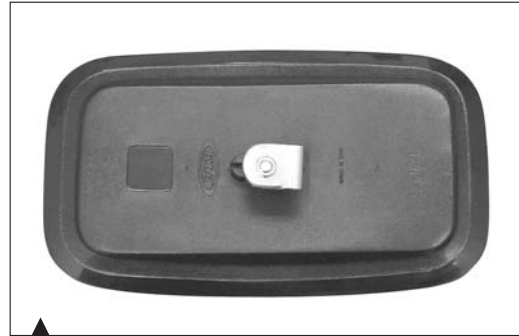
Part No. Z-MIR-KLMB326 (300 x 170) Convex mirror, ball joint mount, black finish.