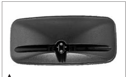
Part No. Z-7818000F. (444 x 208) European head, flat glass, plastic moulded mirror head, universal clamp suits 14-20mm arm.