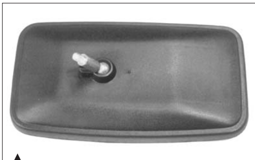
Part No. Z-MIR-TH1621. (250 x 135) Convex mirror, ball joint mount, Black finish.