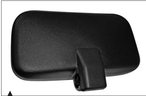
Part No. Z-MIR-TH1669 Convex Mirror. Black finish.