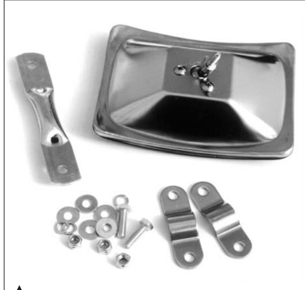
▲ Part No. Z-7001445 - 6 x 4.5 inches Convex mirror, Stainless Steel.