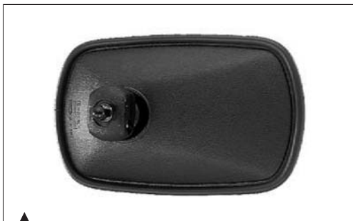
Part No. 7182-301. (263 x 160) Convex glass 1200mm. Plastic moulded mirror head, clamp suits 16mm arm, bracket to suit 1422080.