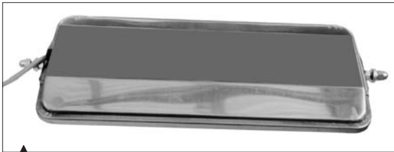
Part No. Z-6364 H/S - 7" X 16" 12 volt heated plain Part No. Z-6364G - Mirror Glass