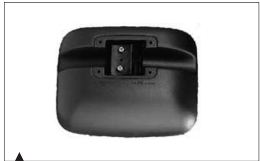
Part No. 7107-001 (268 x 207) Convex glass 1800mm. European head, plastic moulded mirror head, universal clamp suits 16-20mm arm.