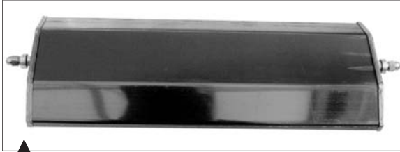
Part No. Z-6365 H/S - 6" X 16" Plain 12 volt heated Part No. Z-6365G - Mirror Glass