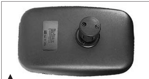
Part No. 7112-022. (282 x 174) Convex glass 1800mm. Plastic moulded mirror head, universal clamp suits 10-22mm arm, bracket to suit 1422080.