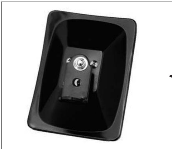
▲ Part No. 1421014 - 150mm X 110mm Black finish, metal housing, supplied with tubular bracket and separate clamp.