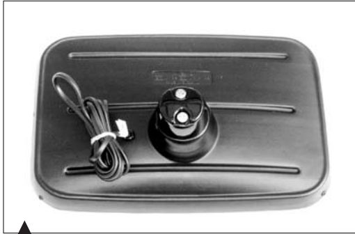
Part No. 060830-0 - Non heated Part No. 064572-4 - 24 Volt heated Convex mirror (360 x 240mm)