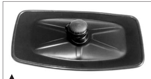
Part No. Z-MIR-TH1659. (430 x 230) Convex mirror, black finish, Scania.