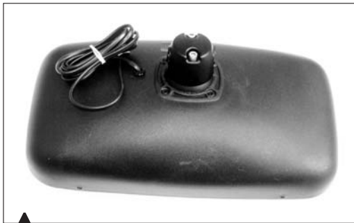
Part No. 066006-7 - Non heated Part No. 065807-7 - 24 Volt heated Convex mirror (410 x 220mm)