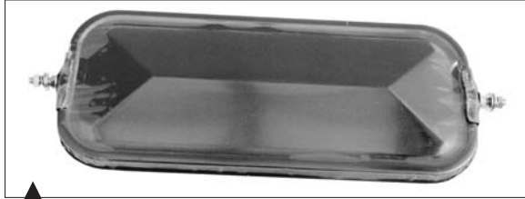
Part No. Z-6362 SS - 7" X 16" Mono Rib back