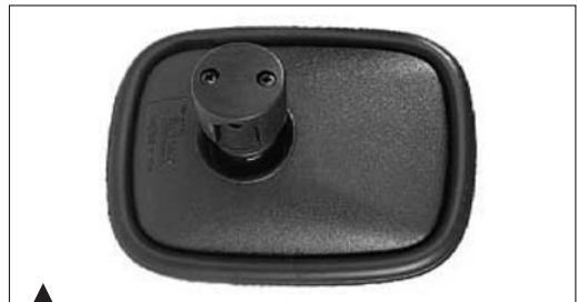
Part No. 7120-321. (195 x 143) Convex glass 1200mm. Plastic moulded mirror head, universal clamp suits 10-22mm arm, bracket to suit 1422080.