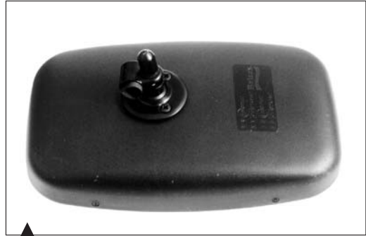
Part No. 065810-6 - Non heated Part No. 065809-0 - 24 Volt heated Convex mirror (280 x 180mm)