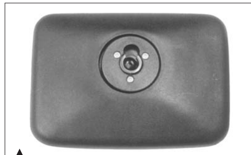
Part No. Z-MIR-TH1617. (210 x 150) Convex mirror head, Daihatsu V76, 116.