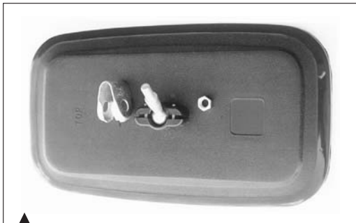
Part No. Z-MIR-KLM326. (300 x 170) Convex mirror, ball joint mount. Black finish.