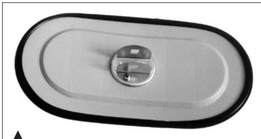
Part No. Z-MIR-TH1609. (305 x 160) Convex mirror, clamp on.