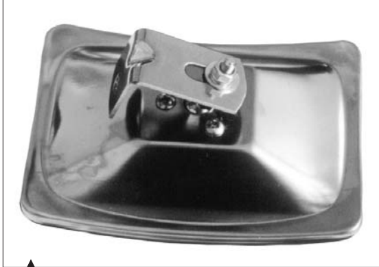
▲ Part No. Z-6389 SS - 6 x 4.5 inches Convex mirror, Stainless Steel.