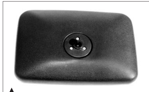
Part No. Z-MIR-TH1618. (275 x 190) Convex mirror, Daihatsu V57, 48, 58.