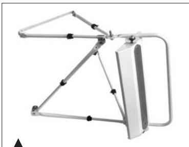
Part No. Z-MIR-B1606 Westcoaster mirror and arms assembly. White finish with orange reflector.