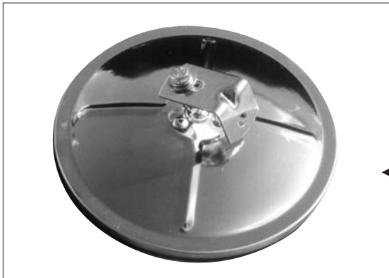
▲ Part No. Z-6305 B/S - 5" round Part No. Z-6306 B/S - 6" round Part No. Z-6307 B/S - 7" round Convex mirror, Stainless Steel.