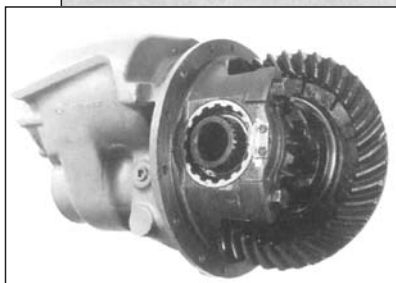
SSHD & RT Series Diff Heads Ratio made to suit