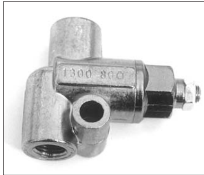
Part No. Z-1300/80 Adjustable