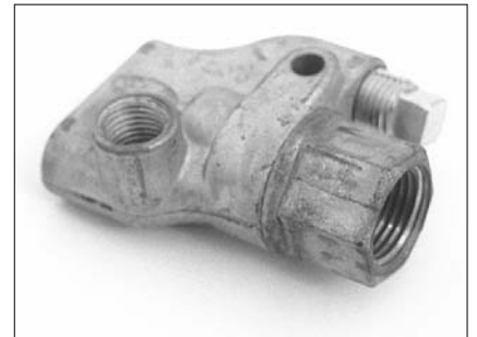
Part No. Z-5200