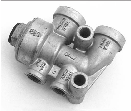
Part No. Z-7700