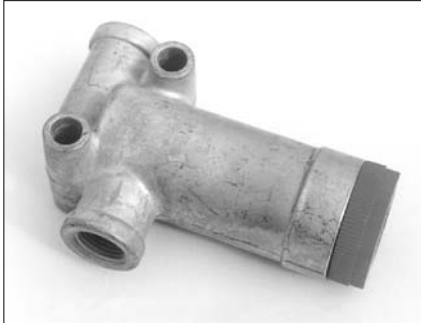
Part No. Z-2550