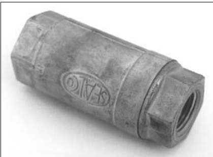
Part No. Z-2200/8 1/2" Part No. Z-2200/4 1/4"