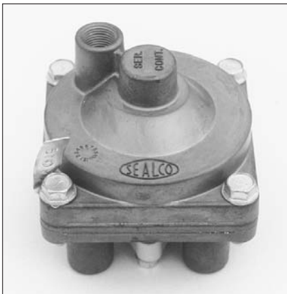
Part No. Z-110380 LOV-4 Crack Pressure (PSI) 1.5