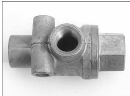
Part No. Z-320100