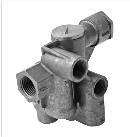
Part No. Z-110903 Protected Reservoir System