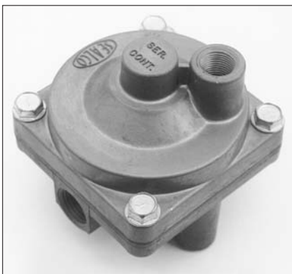
Part No. Z-110360 LOV-2 Crack Pressure (PSI) 1.5