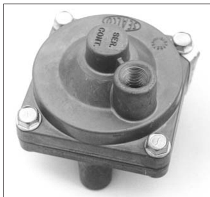
Part No. Z-110410 Crack Pressure (PSI) 4.0