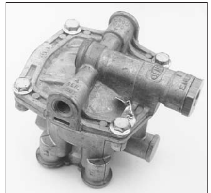
Part No. Z-110470 Cracking Pressure 4.5 Ratio Feature Yes