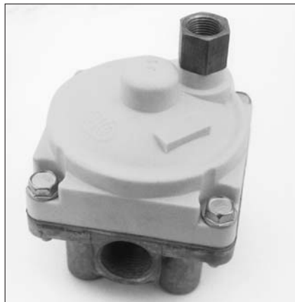
Part No. Z-110415 Crack Pressure (PSI) 4.0